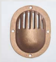
Mini Scoop IS20003