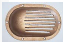
Small Scoop IS20001