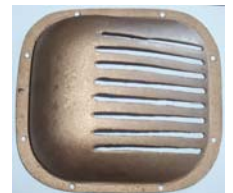
Large Scoop IS20004