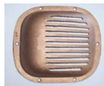
Medium Scoop IS20002